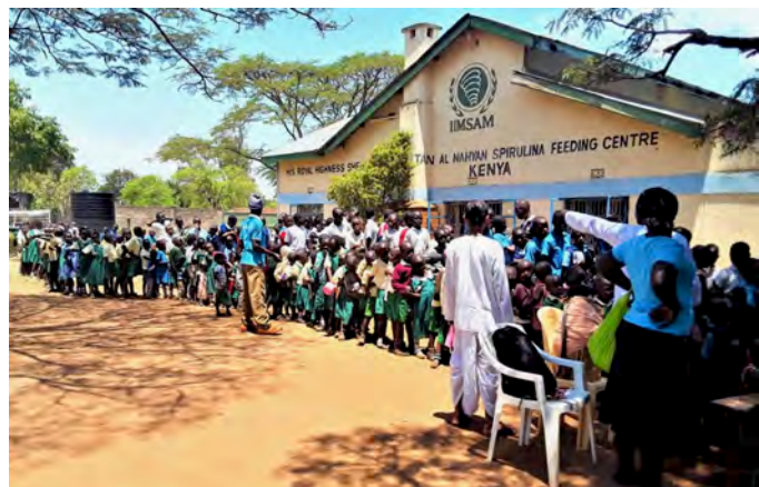
"Spirulina for Everyone"

" IIMSAM'S SH.ZAYED CENTRE IS A FREE MALNUTRITION ZONE IN KISUMU KENYA "